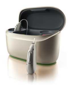
Phonak ChargerGo RIC Infinio with built in battery for charging on the go