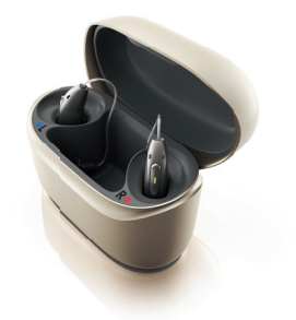
Phonak Charger RIC Infinio for cable charging