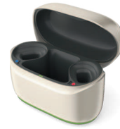
Phonak Charger RIC I